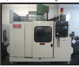
OKK PCV-60, 40"x25"x21" Travel, 10K RPM, 40T, Box Ways, 30 ATC, Fanuc OM, Rigid Tap. 1991.