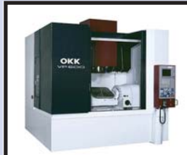
"New" OKK 5 AXIS - VP Series, 12 or 20K RPM, 40T, Tilt Trunion Tables. Stock Deals.