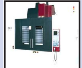
"New" OKK VM-900, 81" x 37" x 32" Travels, 50T, Box Ways, 10K RPM, Fanuc Control.