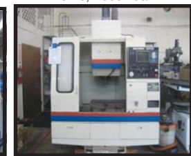
TAKISAWA MAC-3V, 7000 RPM, Box Ways, 30"x16" Travels, 24 ATC, Geared Head, FANUC OM. 1991.