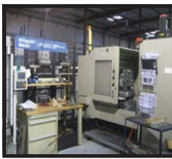
HITACHI SEIKI Hi-Cell CH250, 5 Axis CNC Lathe, Live Tool, Sub Spindle, Y Axis, 60 Station Tool Changer, 10" Chuck, 2.5" Bar, 8" Chk on Sub, Loaded with Tooling. 2001. Call.