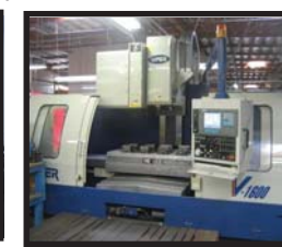
MIGHTY VIPER VMC-1600, 60"x30" Travels, CAT-50, 8K RPM, Box Ways, Augers, 32 ATC, Chiller, Mitsubishi Magic 64, Very Low Hours. 2000.