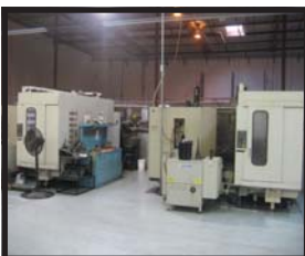
HITACHI SEIKI HS-500, 2 Machine Cell, 25 PALLET FMC, 19.7" Sq. Pallets, 12K RPM, BT-40, CTS, Full 4th, Chillers, 260 Station Tool Changers, Fanuc 16M, Pallets and Tooling Included. New in 2001. Call.