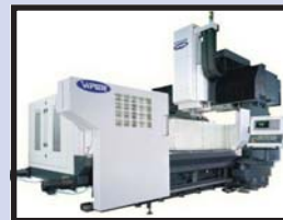
"New" MIGHTY VIPER BRIDGE MILLS - Sizes from 81"x60", 120"x60", 120"x80" and Bigger. Stock Specials