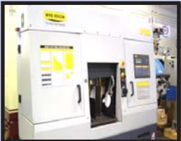
"NEW" HYD-MECH H-10A, CNC Automatic Horiz Bandsaw, 10"x10" Capacity, 5HP, Dual Post, Bundle Cutting, Variable Vise Pressure.