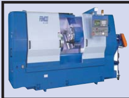
"New" FEMCO HL-55, 15" or 18" Chuck, 4.5" Bar, 42" Centers, 28" Swing, Box Ways, 2 Speed Gear Box, Fanuc OiT. Stock.