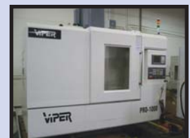
"New" MIGHTY VIPER PRO-1000AP, 40"x23" Travel, Box Ways, 10K RPM, 24 Side Mount ATC, Chip Conveyor, FANUC OiM. Warranty.