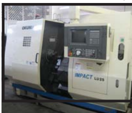
OKUMA LU-25-2SC 4 Axis Twin Turret, 10" Chuck/3" Bar, 25" Centers, OSP-U100L, Chip Conv., 40 Hp, 2002, Xlnt