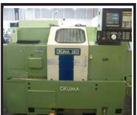
OKUMA LB-15, 8" Chuck, 12 Turret, Tailstock, Chip Conveyor, OSP 5020L Control. 1994.