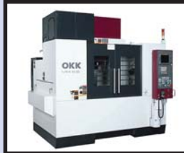
"New" OKK VM-5III, 40"x20"x20" Travels, 10K RPM, 30 ATC, Box Ways, Fanuc 180i, 1417 IPM Rapids, 40 or 50 Taper. Both in Stock.