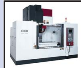
"New" OKK VM-7III, 60"x29"x25" Travels, Box, 50T, 30 ATC, 6K or 10K RPM, Fanuc 180i, Stock Deals