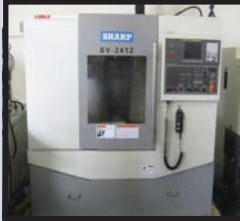
"New" SHARP SV-2412 VMC, 24"x12"x18" Travels, 10 ATC, 8K RPM, Box Ways, Rigid Tap, 40T, FANUC OM. Warranty